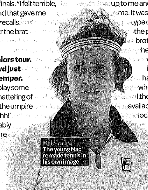
Hair-raiser: The young Mac remade tennis in his own image

There was always a huge pressure on me to win the US Open, so I can understand what he's gone through in trying to win Wimbledon. The US Open may actually be the best place for him to win that first major.