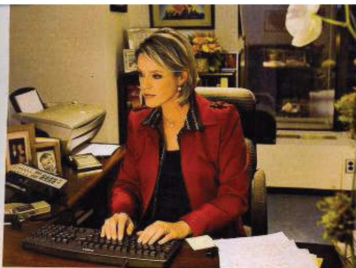
IN THE NEWS Prepping for her nightly anchor post on Inside Edition